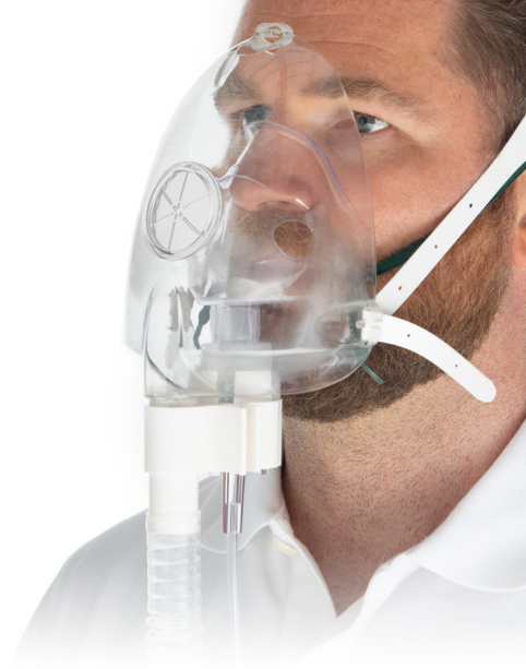
Respiratory Shield System Patent Pending

Our innovative family of products enable healthcare workers to safely and economically administer respiratory treatments and procedures in a portable negative pressure environment.*