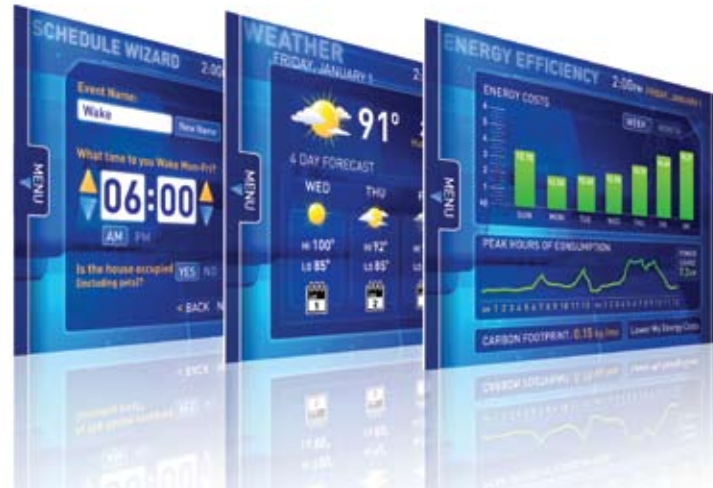
PARKER HANNIFIN INTERACTIVE GUI SCREENSHOTS