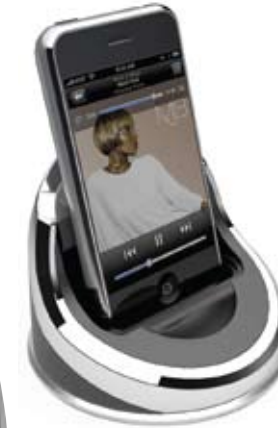
CABIN ACCESSORY IPOD DOCK