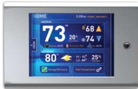
PARKER HANNIFIN INTERACTIVE GRAPHIC USER INTERFACE (GUI)

Break the sound barrier... even before takeoff